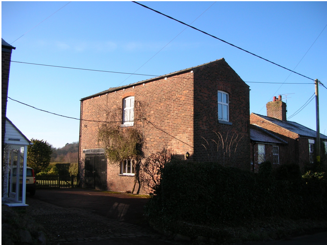
Former Silk Weaving Factory now named 'Silverthorn'

In the 1861 census, silk weavers accounted for 11% of the workforce in the village. After that silk weaving declined due to the import of cheaper French products.